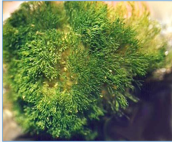
Chlorodesmis caespitosa . A portion of a cushion freshly collected photographed ex-situ.